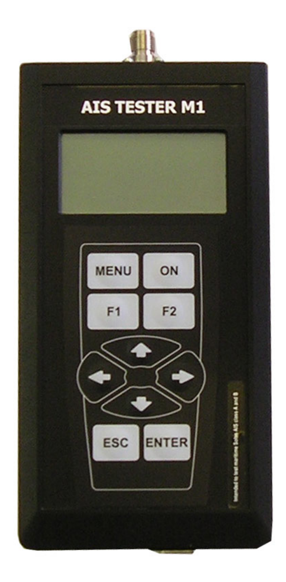
Fig. 1-1. General view