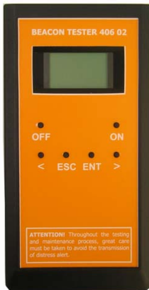
Figure 1-1. BEACON TESTER 406 02